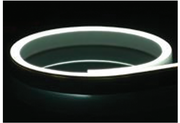
TPR Westflex LED Neon Flat Top