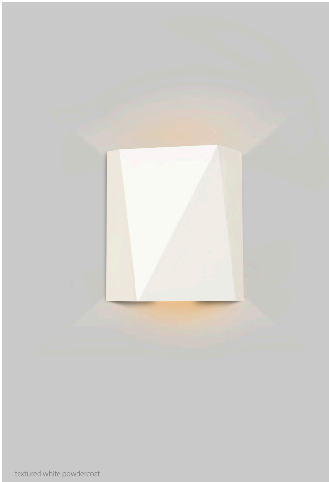
textured white powdercoat