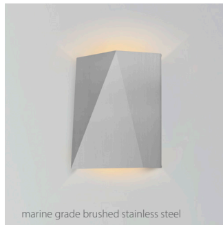
marine grade brushed stainless steel

Cerno's Calx Outdoor sconce is an existing design that we modified to withstand the elements. The materials and components were meticulously designed and engineered to comply and pass UL's wet location requirements.